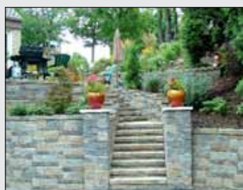
Versa-Lok mosaic steps, pillars and walls in Upper St. Clair