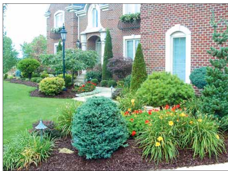
Front yard landscaping in Nevillewood

Purchase price for 85 acres in Upper St. Clair, the township's largest land transfer since the 1950s: $5.4 million