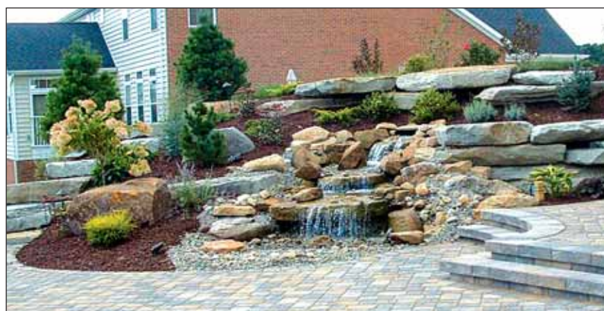
A Stratford paver patio and pondless waterfall in Peters Township.

of home exterior projects, highlighting retaining walls, patios, walkways and driveways, waterfalls, ponds, pondless waterfalls, drainage solution projects and landscaping ideas that are as beautiful as they are functional. Some homeowners and manufacturers representatives are also expected to be on hand to talk with visitors.