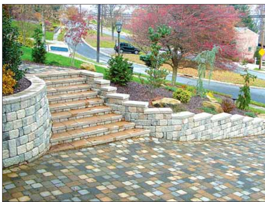
A Unilock Roman Pisa wall and Heritage paver driveway in Bethel Park