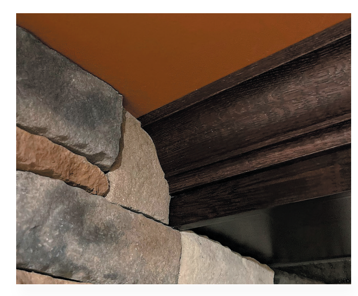
ABOVE: Custom milled guarter sawn white oak scribed to stone veneer wall