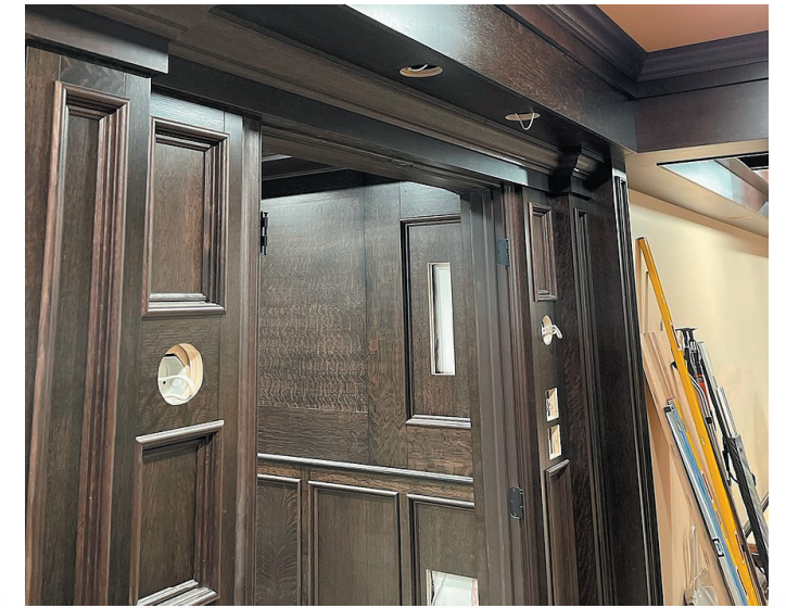
ABOVE: Theater entrance