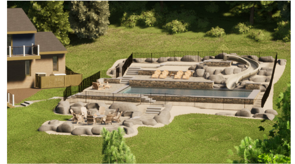
ABOVE: 3D rendering of the entire project

During the evening, the lights from the LED lighting package come on and beautifully illuminate the space so that the fun can continue well into the night.