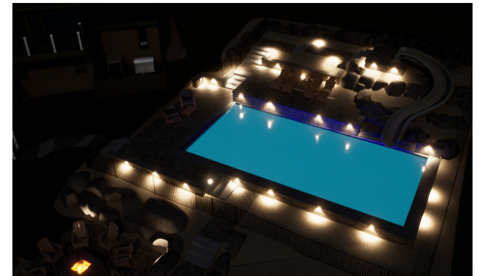
ABOVE: nighttime rendering of the custom pool and surroundings