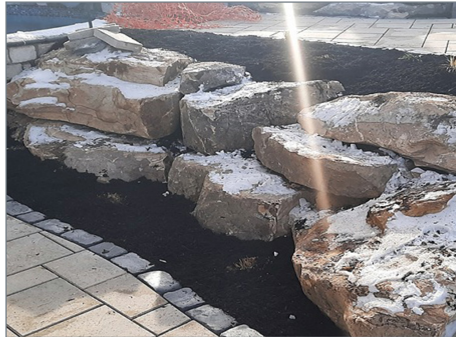
ABOVE: Large natural boulders

We can't wait to show you the final product.