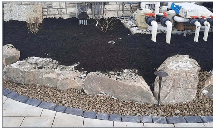
ABOVE: Freshly added mulch