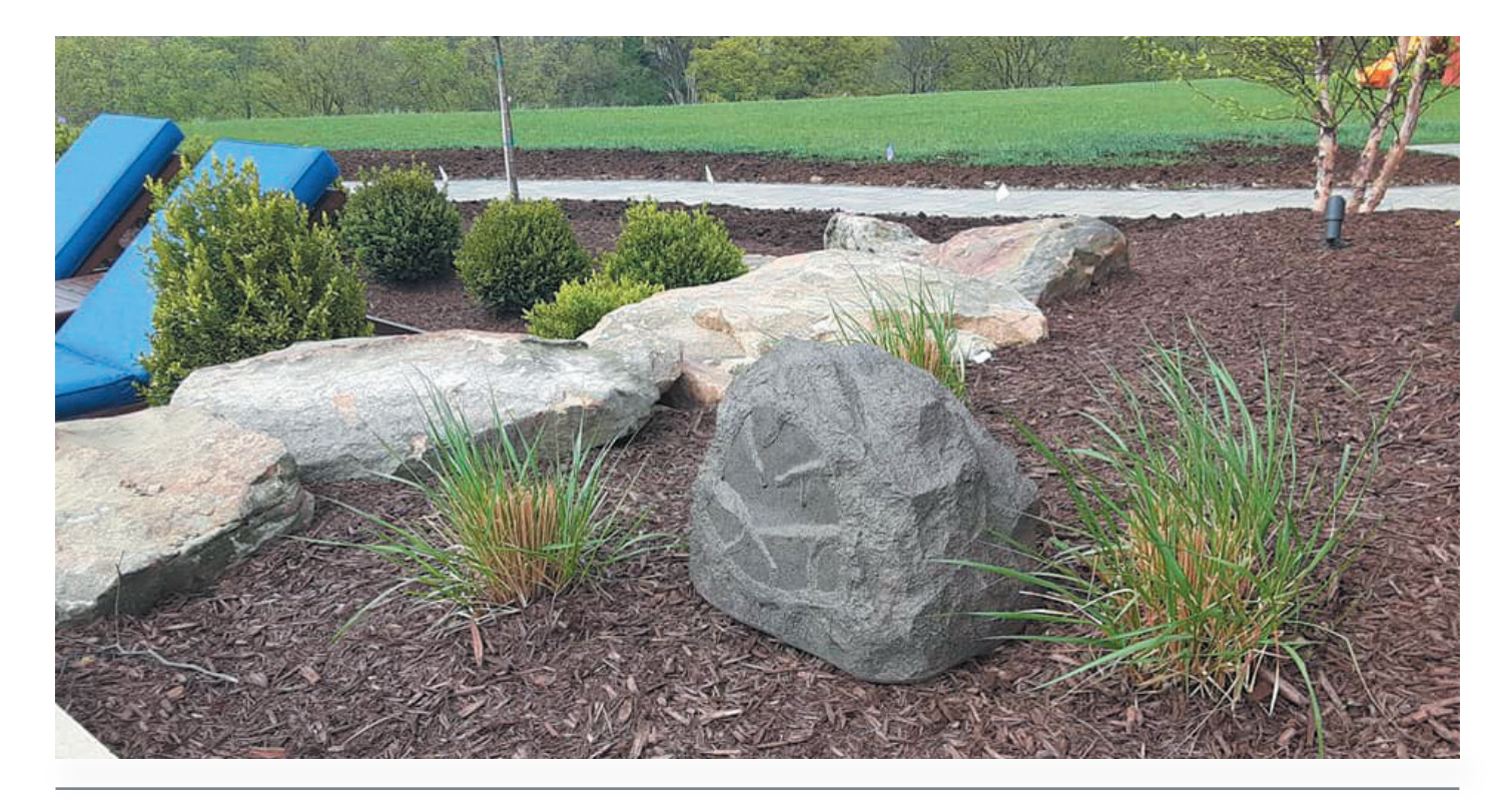
ABOVE: Sonance rock speaker

of mine. We completed a backyard project in Upper St. Clair. Once the pool, patio, and pavilion were finished, we placed Sonance landscape speakers, in the shape of a rock, with subwoofers inside the garden. It all blends in perfectly with the scenery so you don't even know it's there. For the pavilion, we installed Sunbrite full sun TV with 8" overhead Sonance extreme speakers.