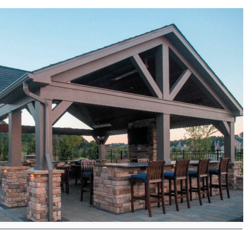
ABOVE: TV mounted on inside of pavilion

Future Communications enhances the PSW client experience with the installation of a large 75" TV screen and custom KEF wireless speakers. The experience showcases stunning design renderings and videos that bring the client's vision to life.